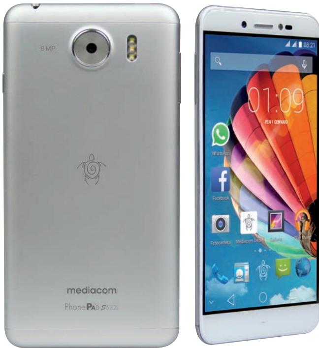
CODICE: M-PPAS532L - versione silver CODICE EAN: 8028153080122