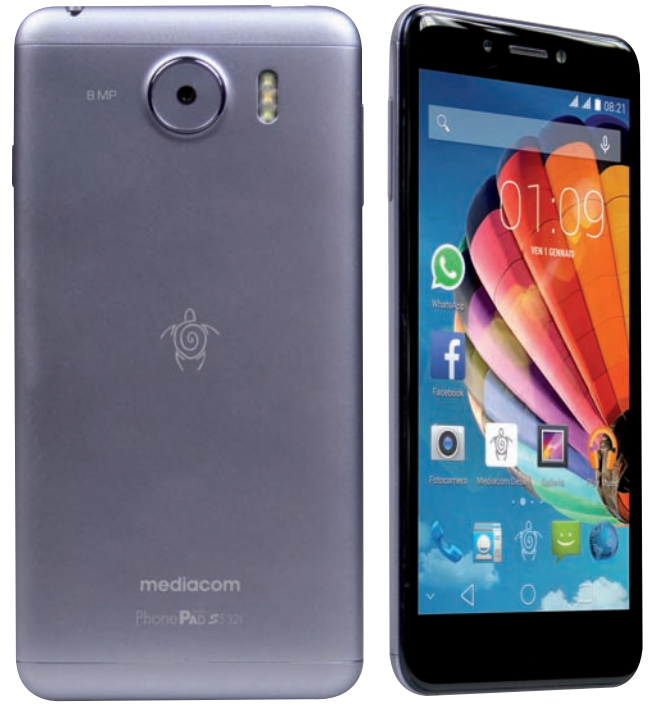
CODICE: M-PPBS532L - versione purple CODICE EAN: 8028153080139